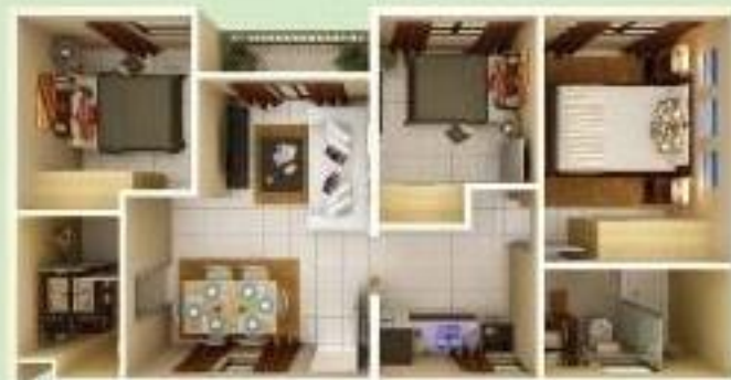
3 Bedroom Suite - 63 sq m