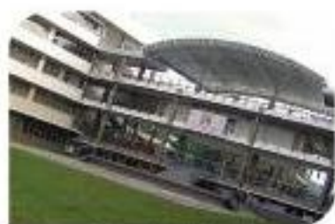
Sacred Heart School