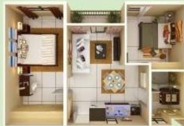
2 Bedroom Standard - 47 sq m