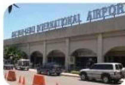
Mactan International Airport

Hanaya is highly accessible to the Cebu business district, industrial zones, schools, hospitals and commercial centers.