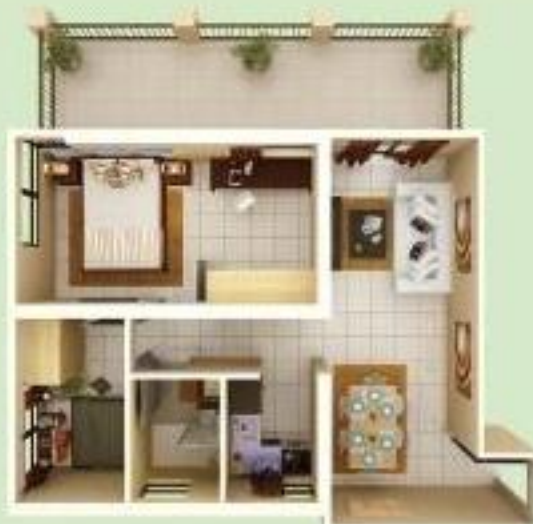
2 Bedroom Deluxe w/ patio - 79 sq m