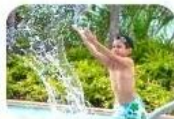
Adult and Kiddie pool.