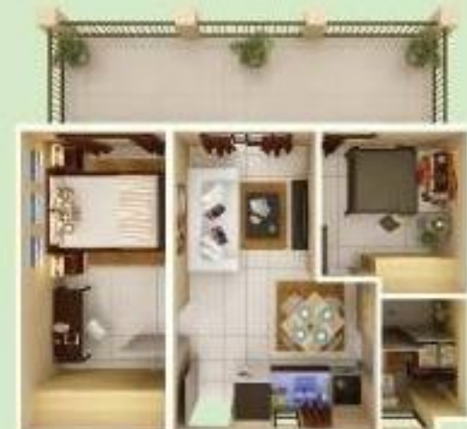
2 Bedroom Standard w/ patio - 68 sq m