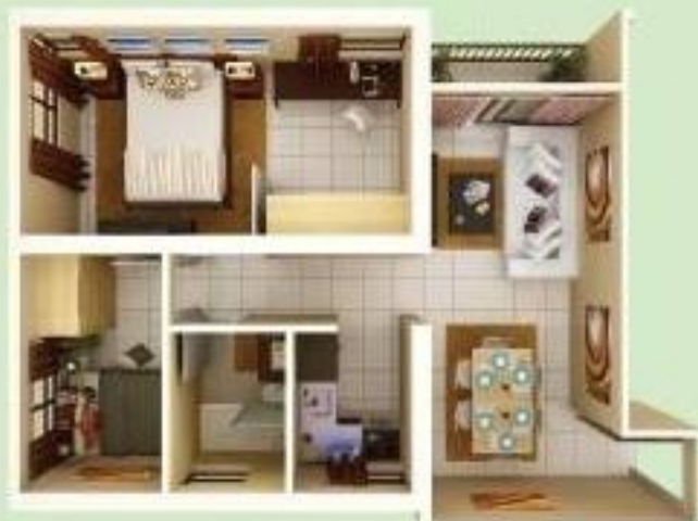
2 Bedroom Deluxe - 58 sq m