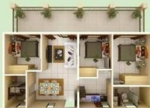
3 Bedroom Suite w/ patio - 91 sq m